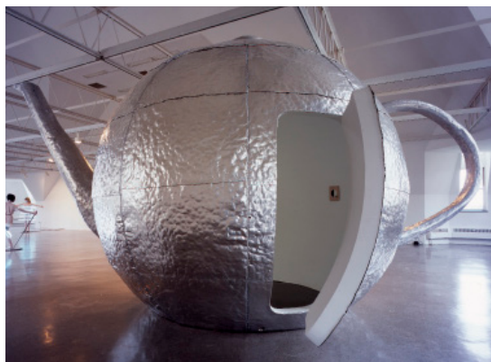
Mai-Thu Perret, Little Planetary Harmony , 2006 Aluminum, wood, plaster, latex paint, neon, acrylic on wood, interior paintings (acrylic on wood) 356 x 643 x 365 cm Coll. Aargauer Kunsthaus, Aarau