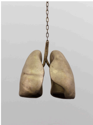
Mai-Thu Perret, Eventail des caresses (Poumons) , 2018 Bronze, variable dimensions Collection Mai-Thu Perret