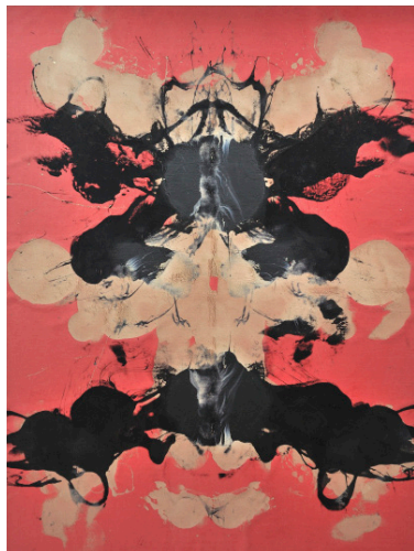
Mai-Thu Perret, The Crack-Up IV , 2009 Carpet Paintings, acrylic framed in wood 240 x 180 cm