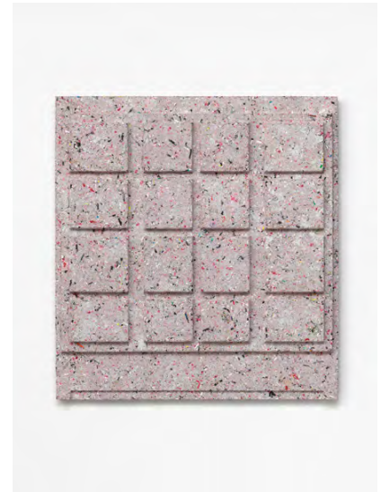
03 Rachel Whiteread Untitled (Sixteen Squares View), 2019 Papier-mâché, 105 x 99 x 7 cm © Rachel Whiteread