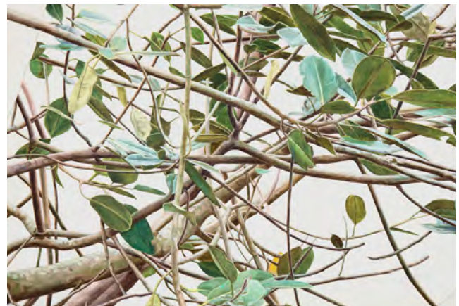
05 Toba Khedoori Untitled, 2019 (detail) Oil and graphite on waxed paper, 249.2 x 335.3 cm Courtesy of the Fredriksen Family Collection © Toba Khedoori Courtesy Regen Projects, Los Angeles and David Zwirner, New York / London Photo: Evan Bedford

Press images: www.fondationbeyeler.ch/en/media/press-images