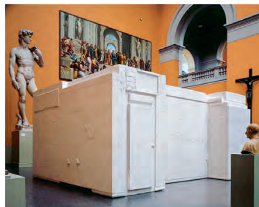
Untitled (Room 101) , 2003 Victoria and Albert Museum, London, 2003

RW It's quite difficult to say anything about it. All I can say is that it does not involve casting. I'm working with materials and objects that have a very similar feeling to casting something, but they are being constructed with my own hands. I've been in a small studio for quite some time. It has been enormously freeing to move into this bigger space – it feels as if I can mentally expand into the space, which is kind of explosive.