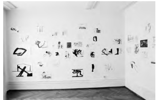
Das subjektive Museum Filiale Basel, 1984

SB I would say what I used to do is not so different from what I do now in fact, though it does look different, of course. I still like watching what people get up to in the street, and it still happens that