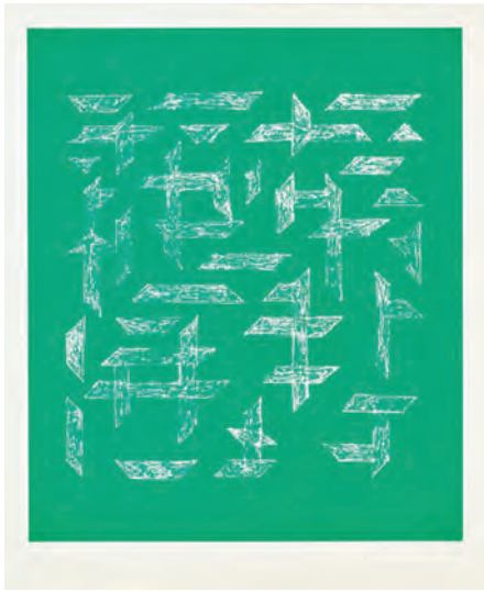
Anni Albers, Double Impression III , 1978, photo-offset, 23.5 × 20 cm, private collection