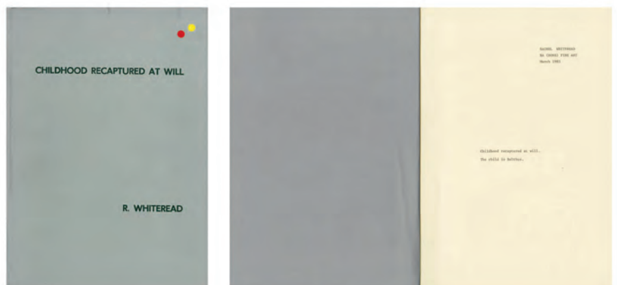
Rachel Whiteread, 'Childhood Recaptured at Will: The Child in Balthus', Dissertation BA (Hons) Fine Art, March 1985

It is not a fully formed idea yet, but that's where I'm coming from. For me, it is the first time that I've tried to work with another person's art directly, and it is not a painting that I like particularly. I'm drawn to Passage because it is so