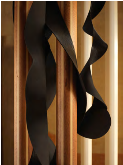
01 Leonor Antunes a seam, a surface, a hinge, or a knot (detail) Official Portuguese representation at the 58 th International Venice Biennale, Palazzo Giustinian Lolin, Fondazione Ugo e Olga Levi, San Marco, Venice, 2019 Courtesy the artist; Air de Paris, Paris; kurimanzutto, Mexico City, New York and Luisa Strina Gallery, São Paulo © Leonor Antunes Photo: Nick Ash, 2019