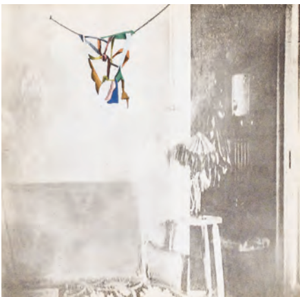
Marcel Duchamp, Sculpture de voyage , 1918, illustration in La Boîte-en-valise by Marcel Duchamp/ Rose Sélavy, Paris 1941 (detail)

I tend to think of the idea of flatness as a volume that can be created starting from the flat surface of a table. There are pieces that I made out of sheets that can be bent, or pieces consisting of tubes and wires that are attached to one another