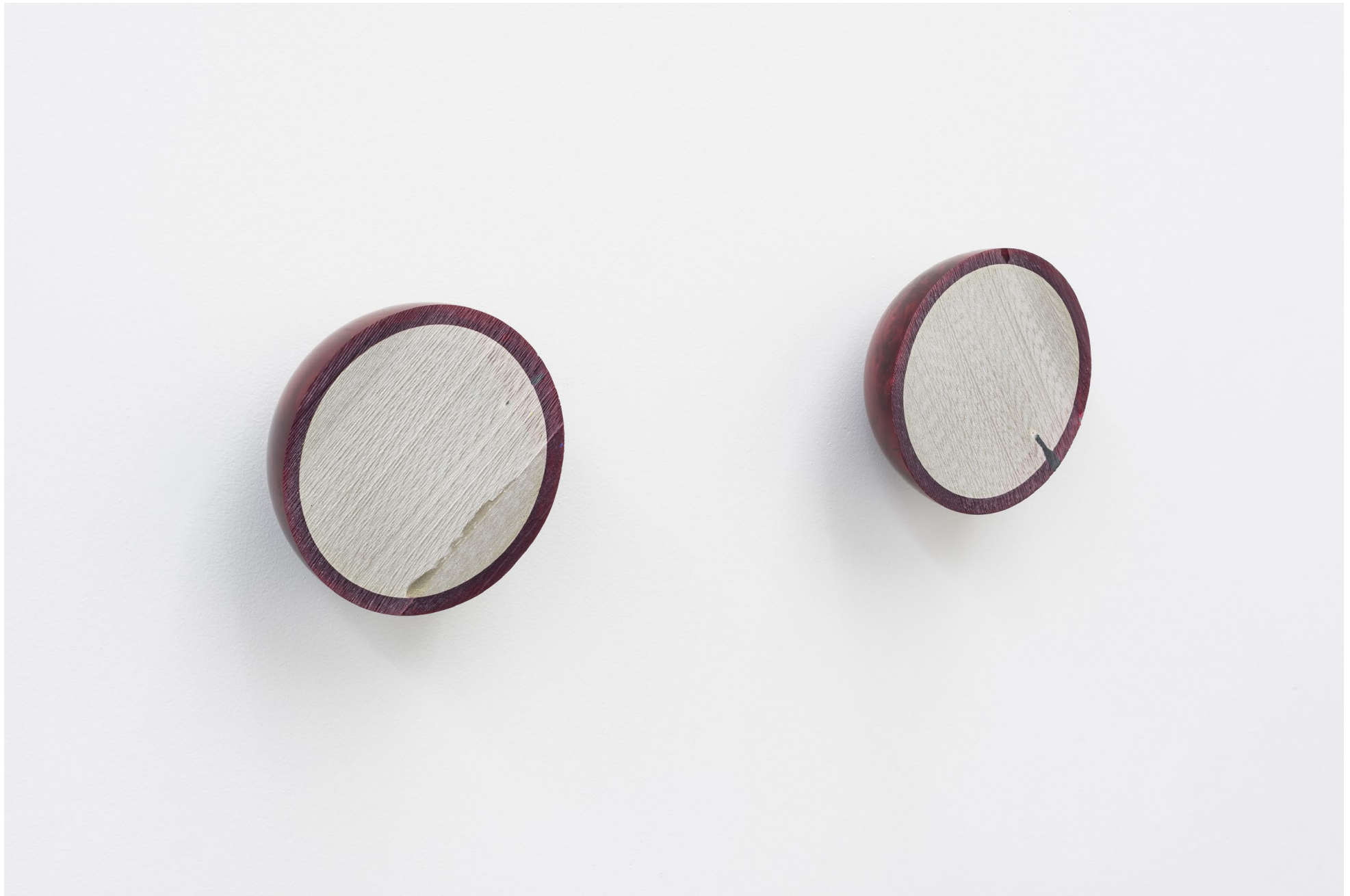
Florian Germann, Untitled, 2020 Bowling ball 21.6 x 21.6 x 10.8 cm, GERM/S 121