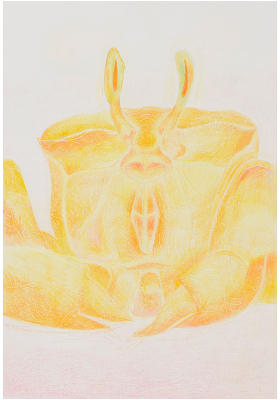
Florian Germann, Untitled, 2020 Detail view