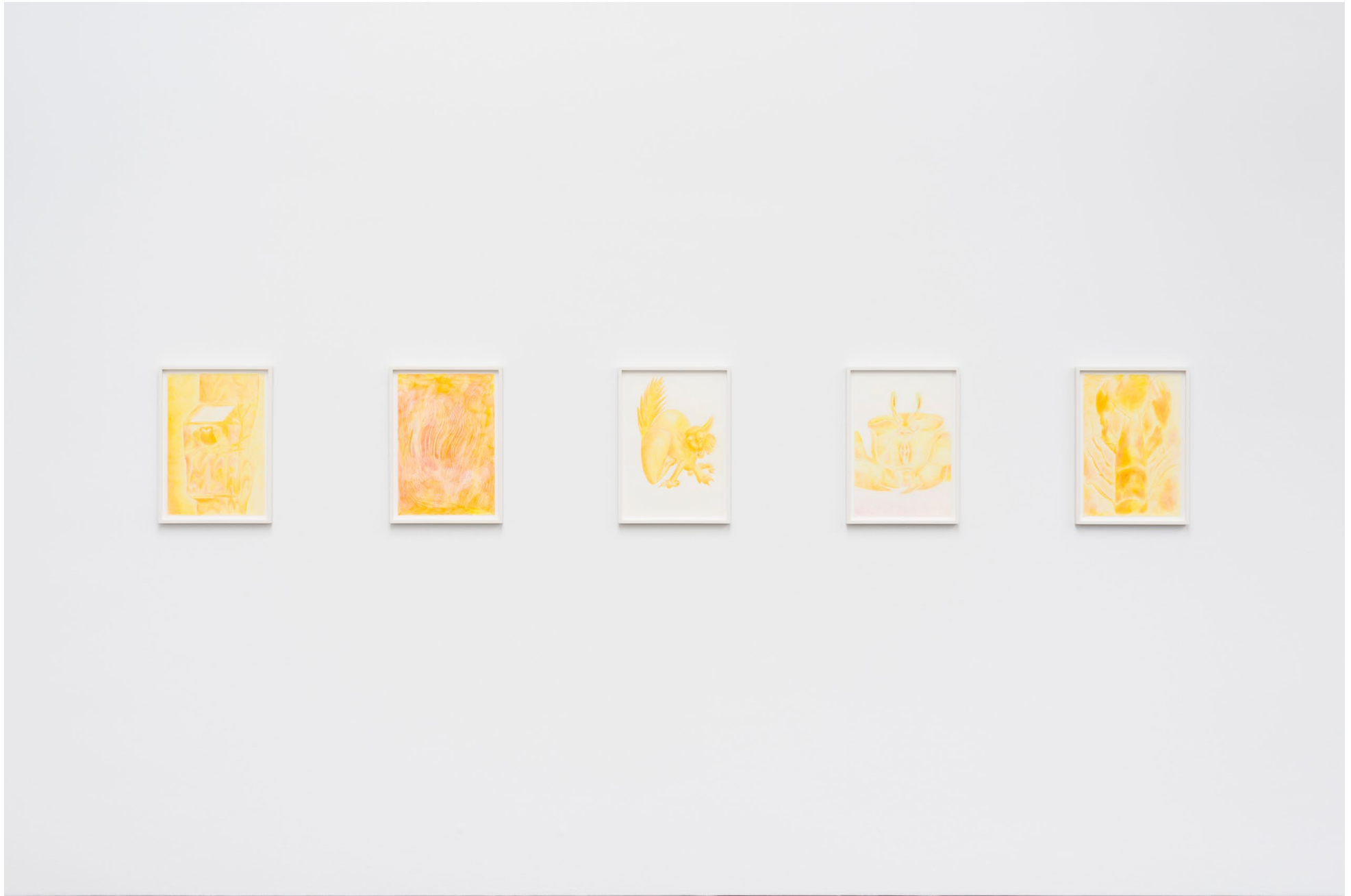
Florian Germann, Untitled, 2020 Colored pencil on paper, framed, five elements Paper: 42 × 29 cm, Frame: 46.3 × 33.3 × 2.8 cm each, GERM/WP 39