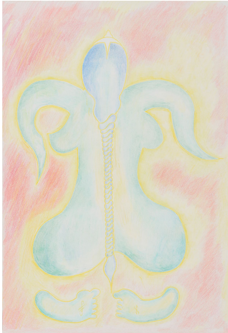
Florian Germann, Untitled, 2020 Colored pencil on paper, framed Paper: 42 × 29 cm, Frame: 46.3 × 33.3 × 2.8 cm, GERM/WP 44