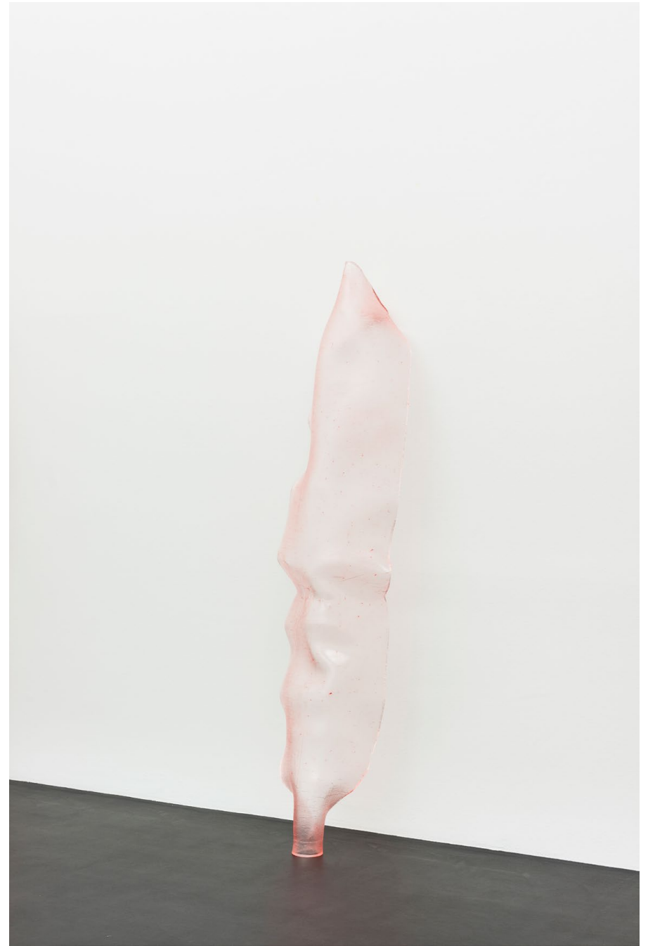
Florian Germann, Untitled, 2020 Bio resin colored with fuel pigments 206 × 48 × 43.5 cm, GERM/S 120