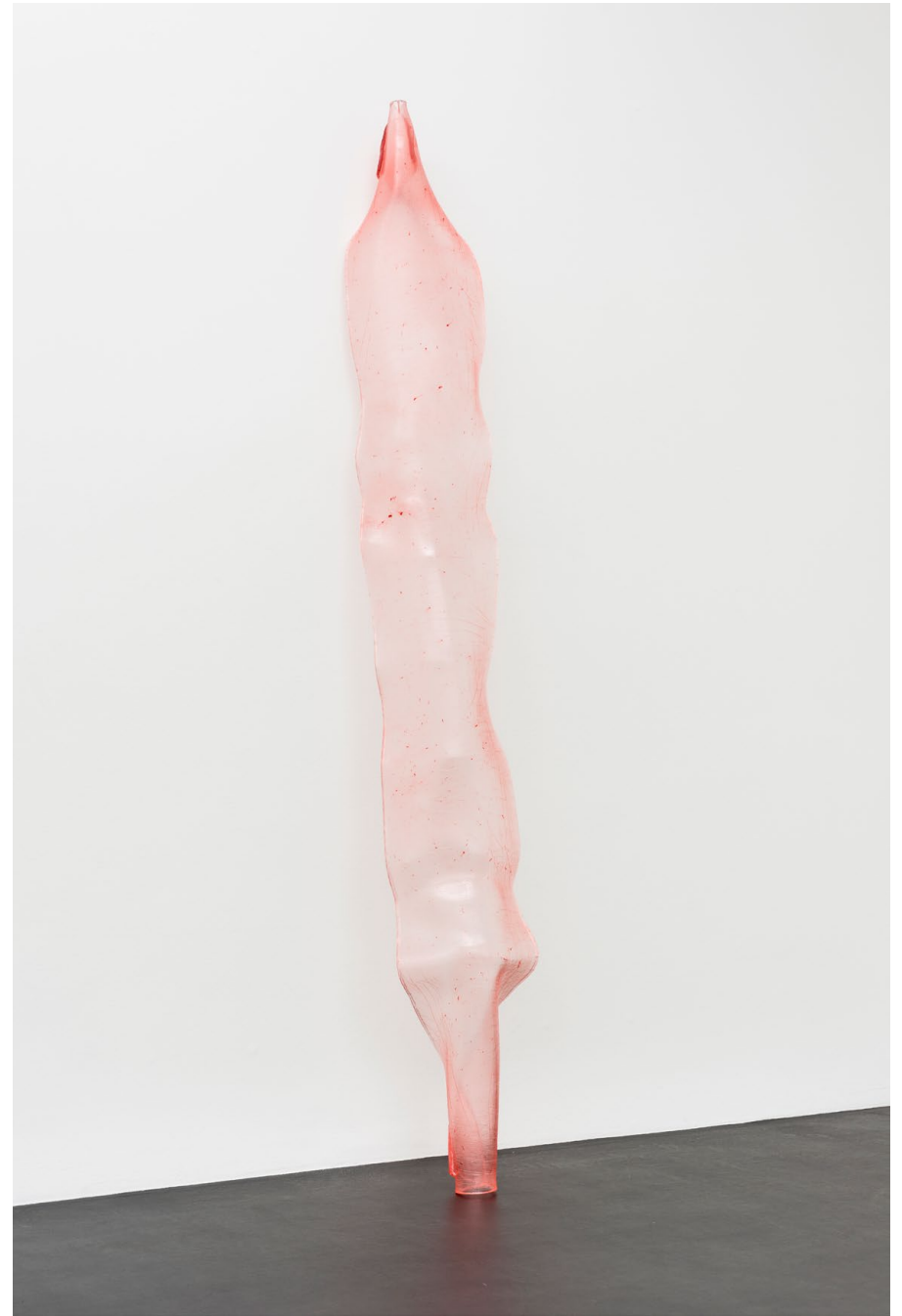
Florian Germann, Untitled, 2020 Bio resin colored with fuel pigments 293 × 39 × 48.5 cm, GERM/S 119