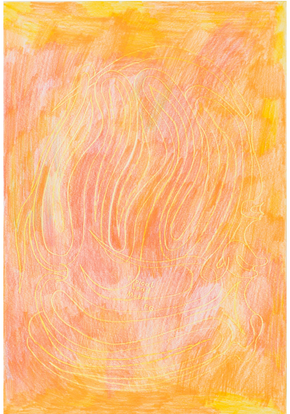
Florian Germann, Untitled, 2020 Detail view