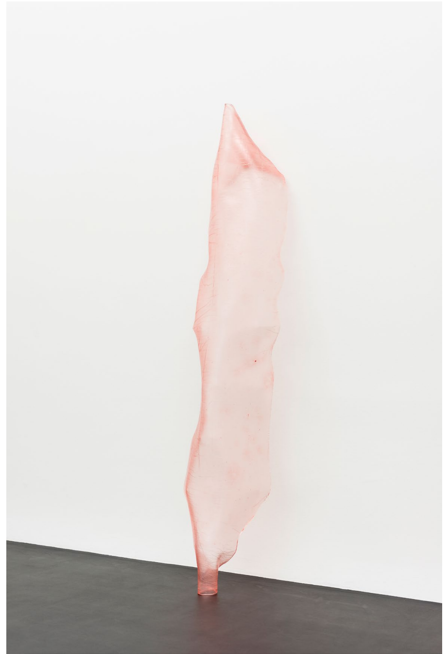
Florian Germann, Untitled, 2020 Bio resin colored with fuel pigments 249 × 52 × 49 cm, GERM/S 117