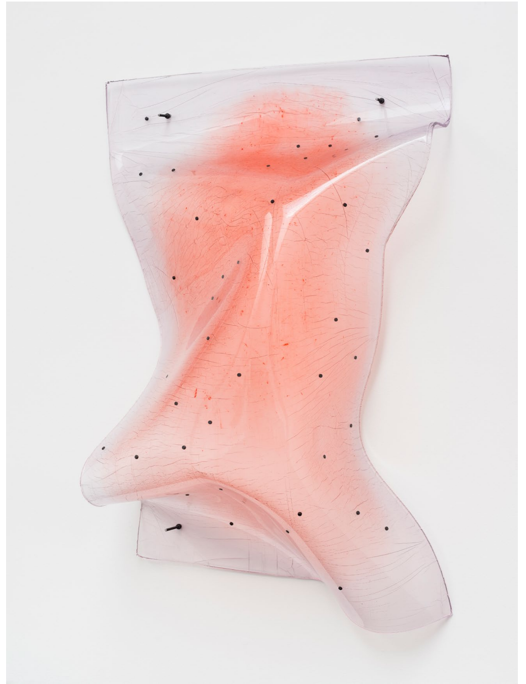
Florian Germann, Untitled, 2020 Bio resin dyed with fuel pigments, ferrite magnets, steel 168 × 114 × 47 cm, GERM/S 114