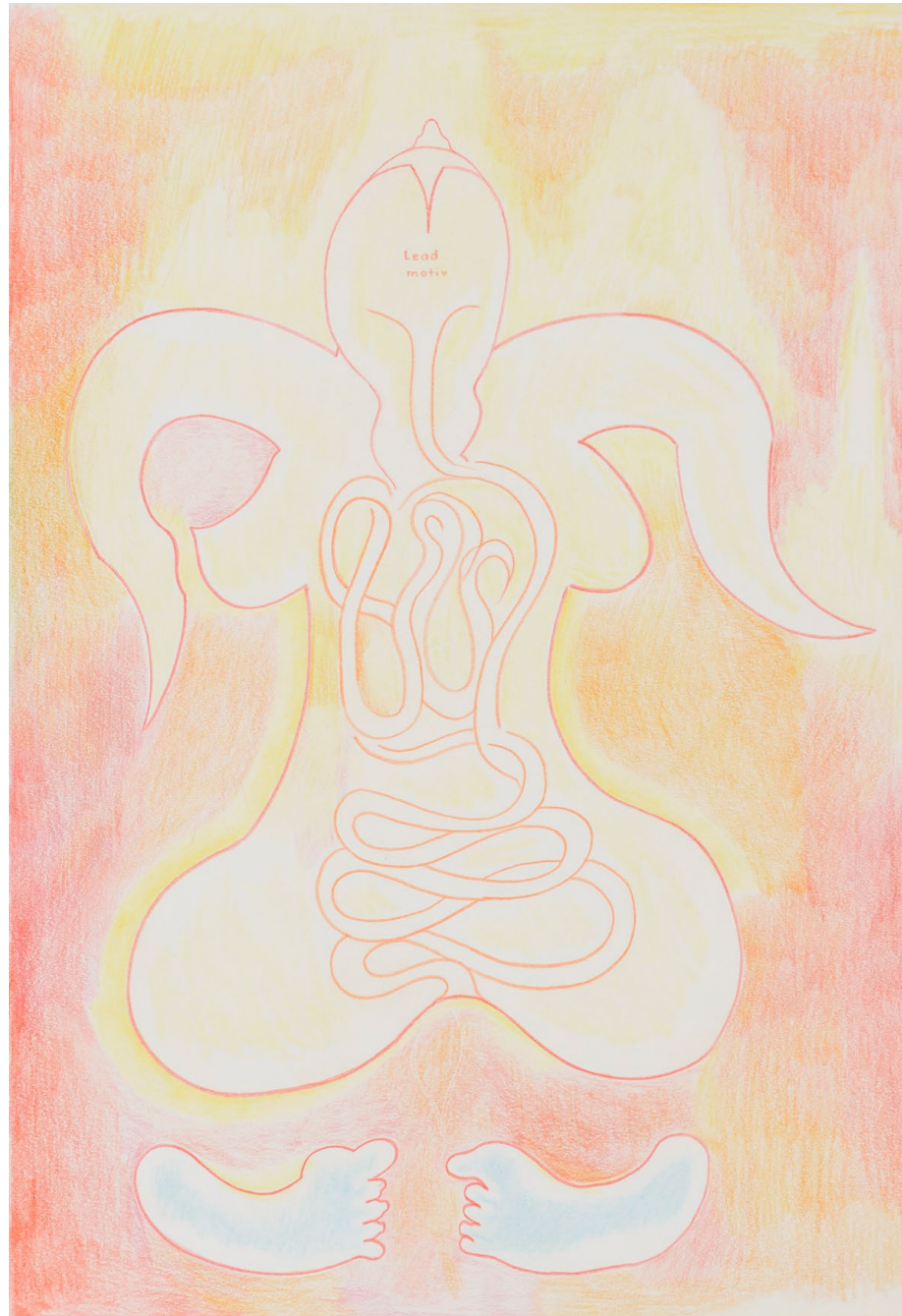
Florian Germann, Untitled, 2020 Colored pencil on paper, framed Paper: 42 × 29 cm, Frame: 46.3 × 33.3 × 2.8 cm, GERM/WP 42