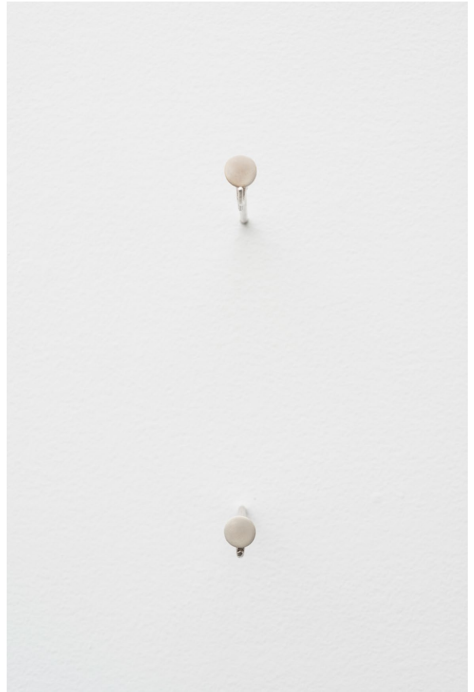
Florian Germann, Untitled, 2020 999 fine silver, two elements 3.3 × 30.5 × 2.4 cm & 3.7 × 30.5 × 2.4 cm, GERM/S 124