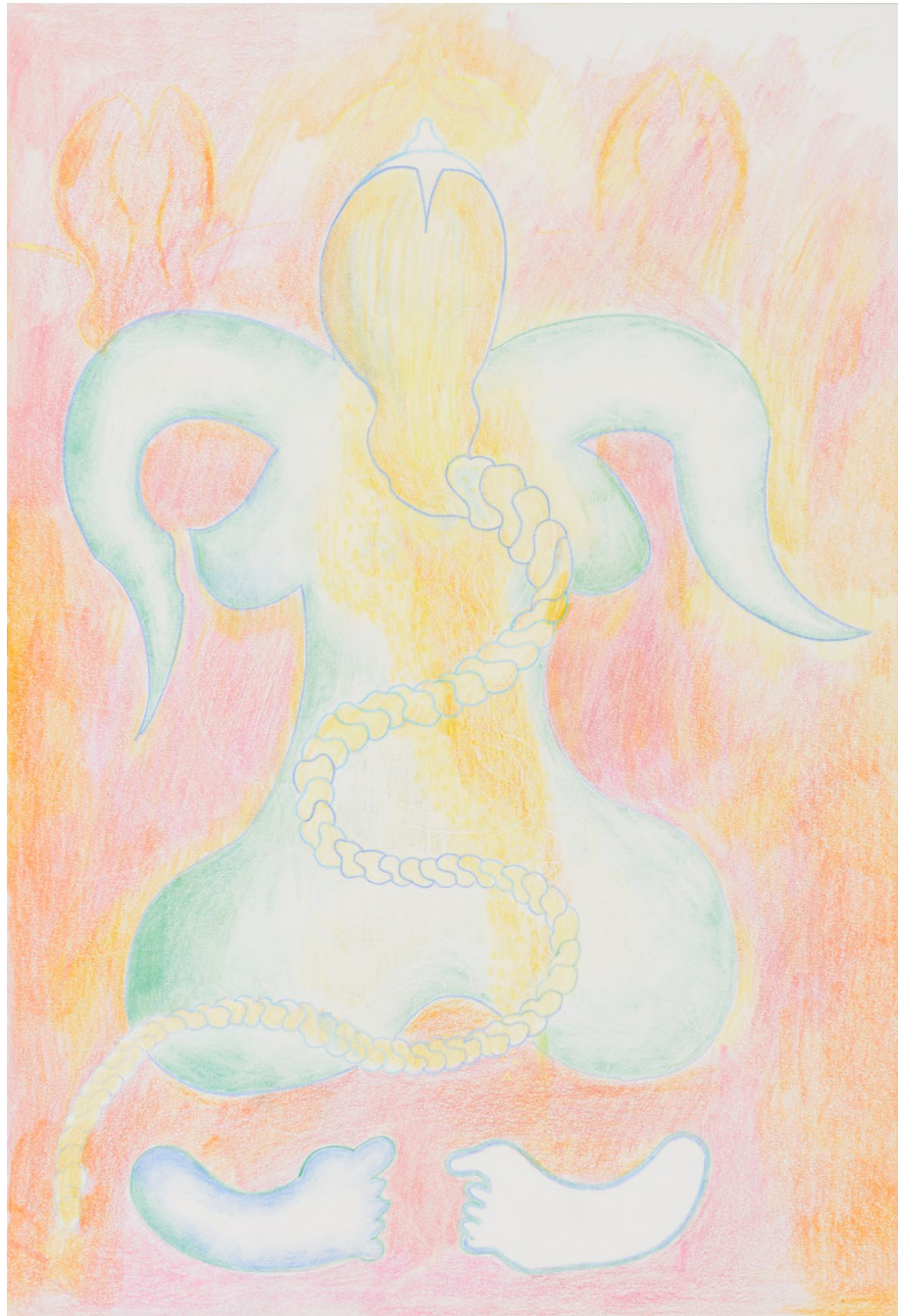
Florian Germann, Untitled, 2020 Colored pencil on paper, framed Paper: 42 × 29 cm, Frame: 46.3 × 33.3 × 2.8 cm, GERM/WP 41