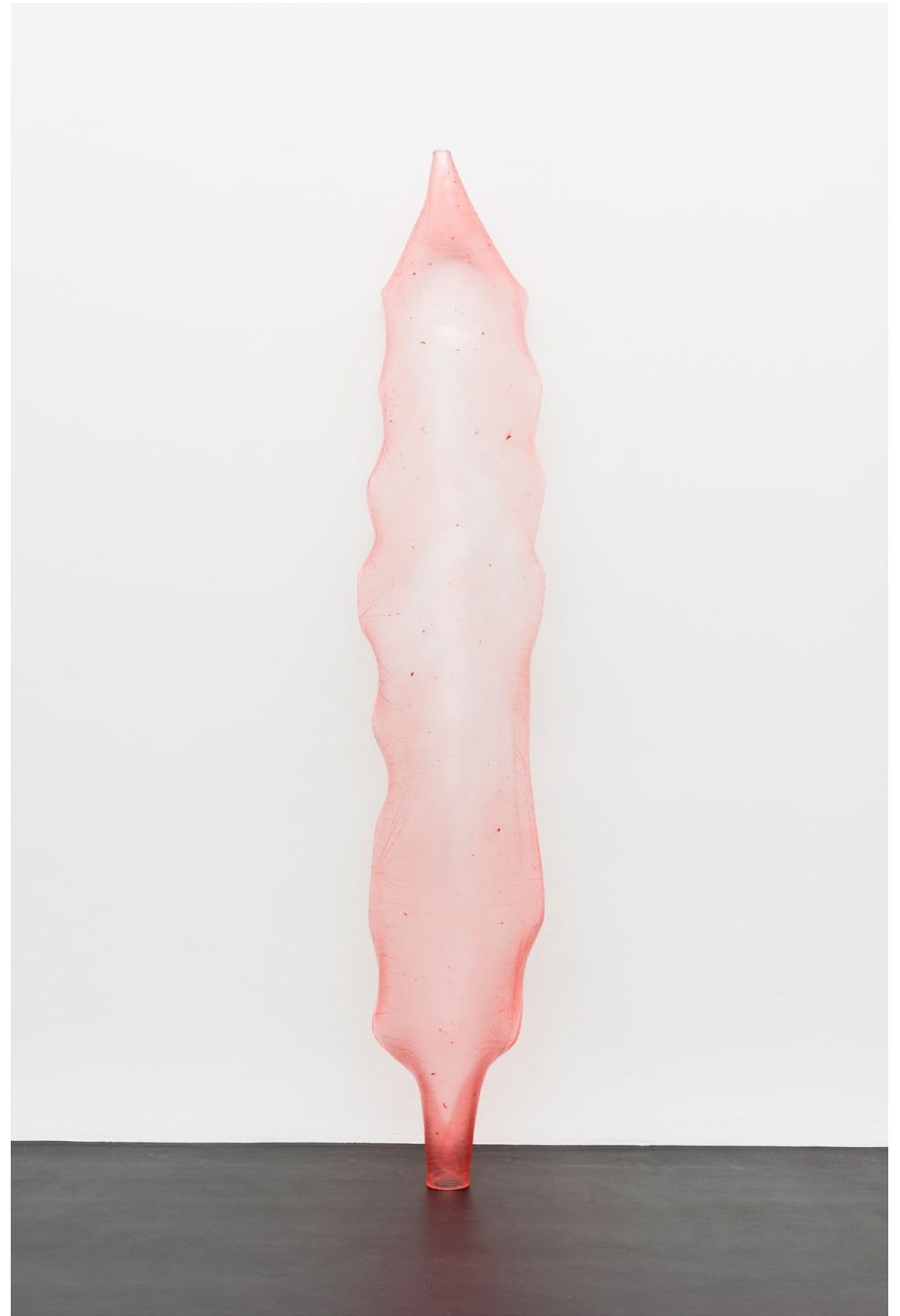
Florian Germann, Untitled, 2020 Bio resin colored with fuel pigments 272 × 51 × 52.5 cm, GERM/S 118