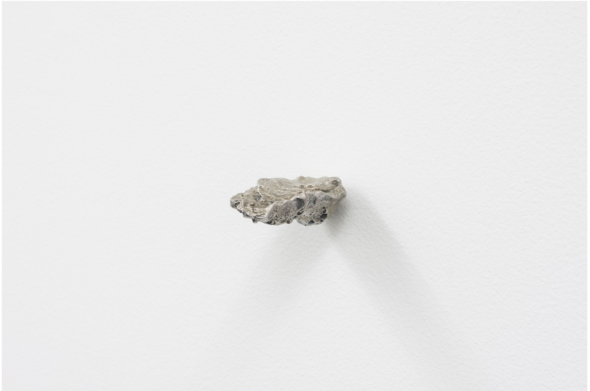
Florian Germann, Untitled, 2020 Cast oyster in aluminium and silver 4.2 x 4.6 x 9.5 cm, GERM/S 123