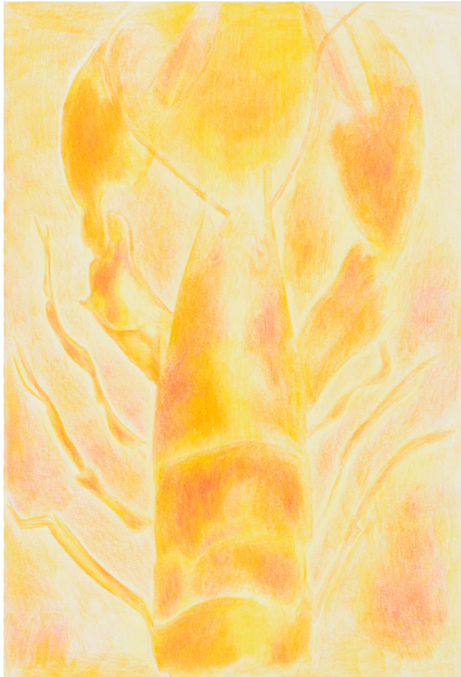
Florian Germann, Untitled, 2020 Detail view