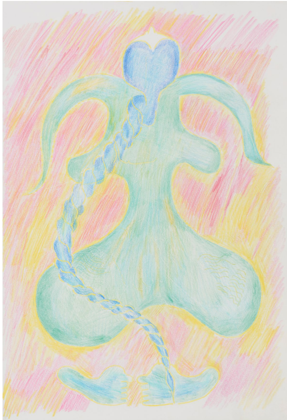
Florian Germann, Untitled, 2020 Colored pencil on paper, framed Paper: 42 × 29 cm, Frame: 46.3 × 33.3 × 2.8 cm, GERM/WP 43