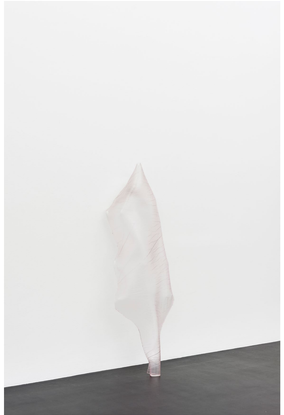
Florian Germann, Untitled, 2020 Bio resin colored with fuel pigments 168 × 54 × 36 cm, GERM/S 116