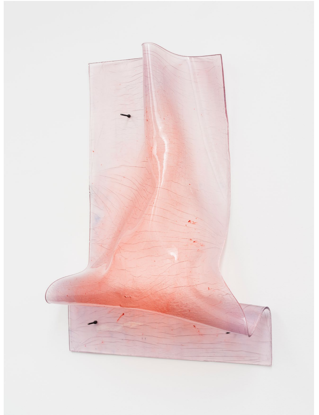
Florian Germann, Untitled, 2020 Bio resin dyed with fuel pigments, steel 157 × 116 × 40 cm, GERM/S 115