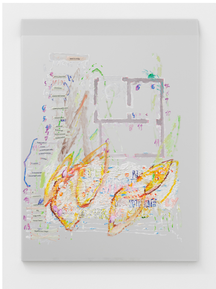
API3, 2021, oil paint, cut-outs and glue on aluminium, 62.5 x 45 cm

+41786599193 PHILIPP@PHILIPPZOLLINGER.COM WWW.PHILIPPZOLLINGER.COM