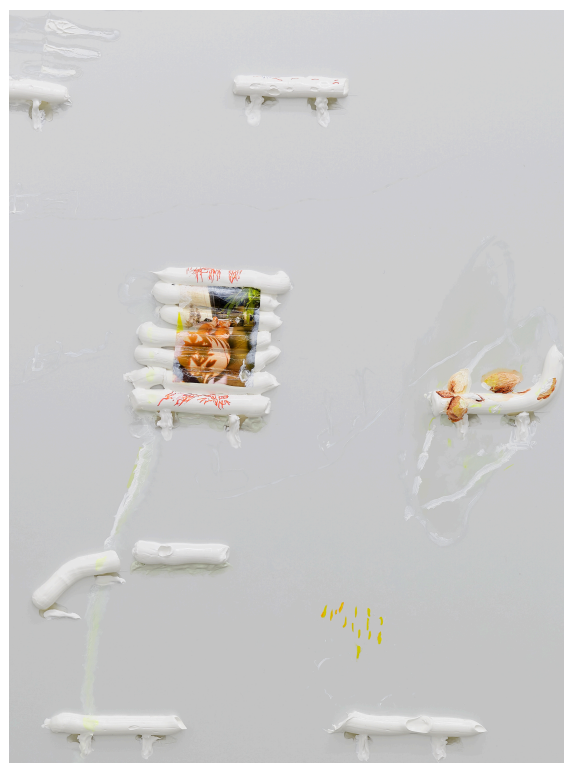
Seducer's Diary , 2021, oil paint, fineliner, cut-outs and glue on aluminium, 125 x 100 cm / 49.2 x 39.3 in