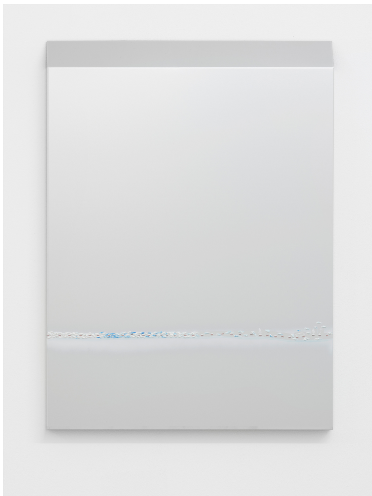
Snakes smile_2: North/south coffin , 2021, oil paint, spray paint and fineliner on hand-tapped aluminium, 62.5 x 45 cm

PHILIPP@PHILIPPZOLLINGER.COM WWW.PHILIPPZOLLINGER.COM