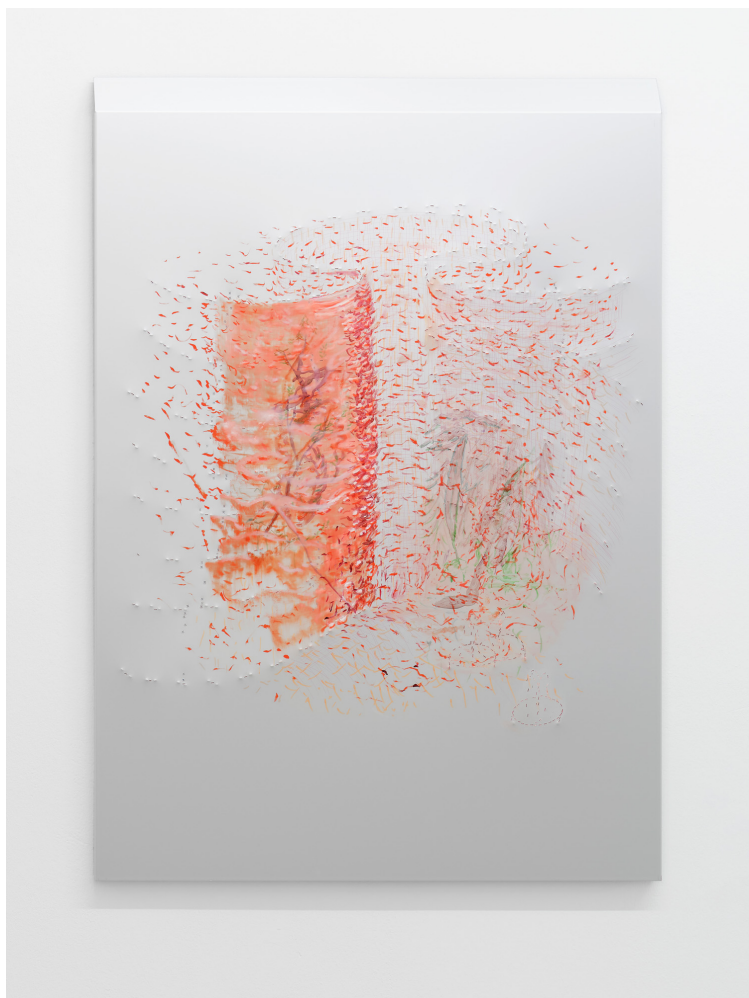
Borscht roulette (blinded astronaut) , 2021, oil paint and fineliner on hand-tapped aluminium, 100 x 70 cm / 39.3 x 27.5 in

PHILIPP@PHILIPPZOLLINGER.COM WWW.PHILIPPZOLLINGER.COM