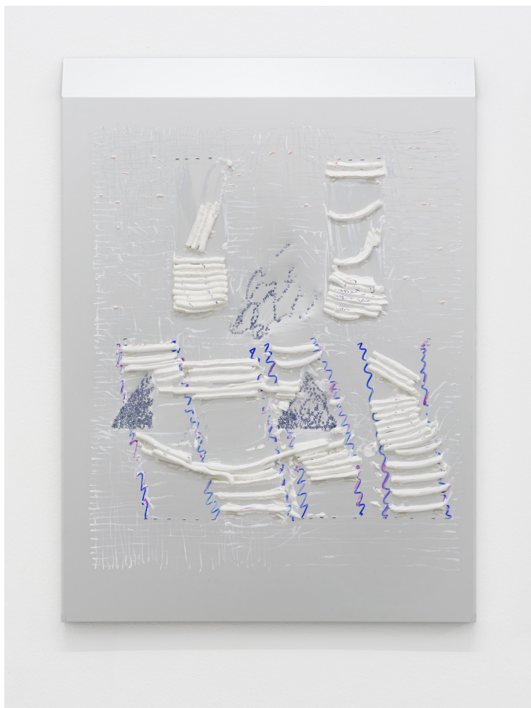
Stairs to downstairs , 2021, oil paint, marker pen and fineliner on hand-tapped aluminium, 62.5 x 45 cm / 24.6 x 17.7 in

+41786599193 PHILIPP@PHILIPPZOLLINGER.COM WWW.PHILIPPZOLLINGER.COM