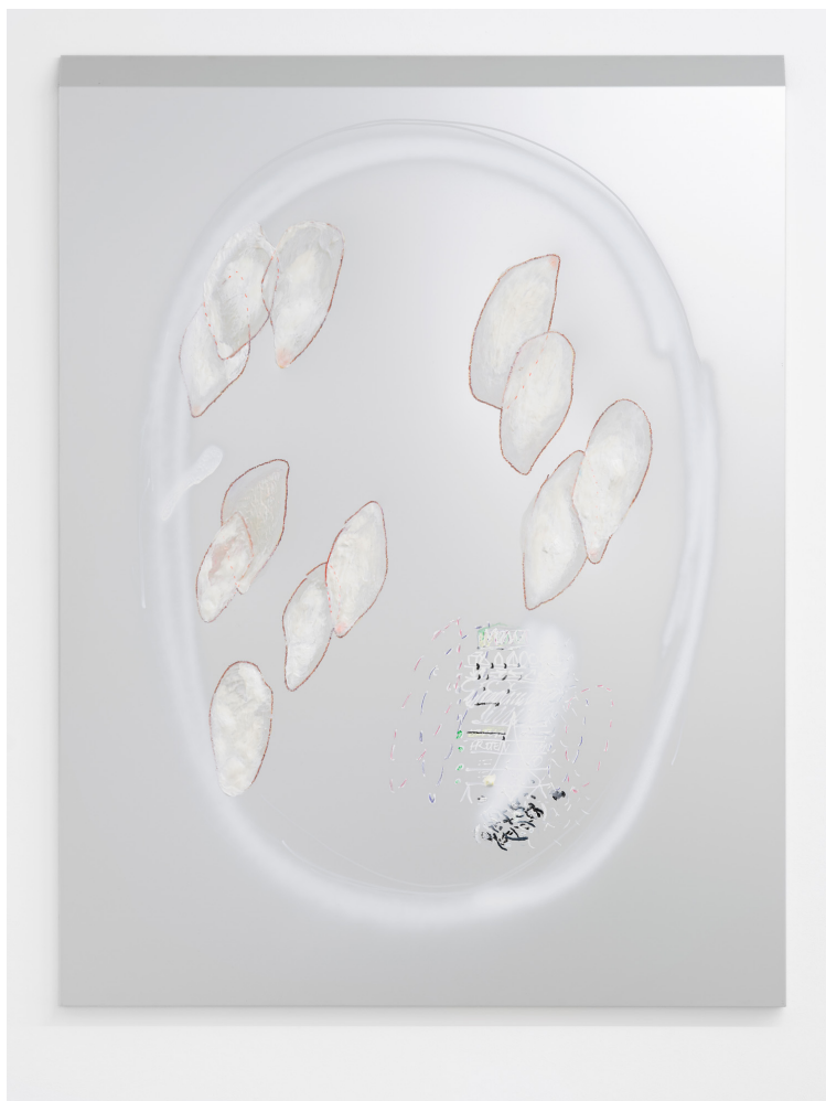
Fillet , 2021, oil paint, spray paint, marker pen and fineliner on hand-tapped aluminium, 125 x 100 cm / 49.2 x 39.3 in

+41786599193 PHILIPP@PHILIPPZOLLINGER.COM WWW.PHILIPPZOLLINGER.COM