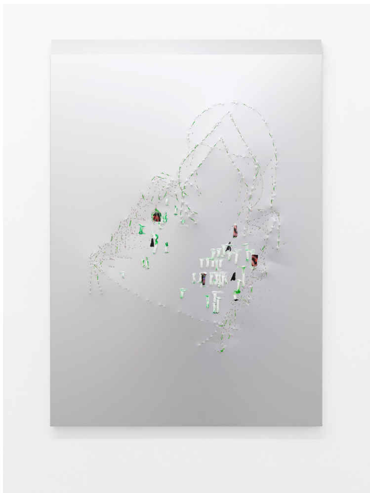
Russian young peppermint , 2021, oil paint, fineliner, cut-outs and glue on hand-tapped aluminium, 100 x 70 cm / 39.3 x 27.5 in

+41786599193 PHILIPP@PHILIPPZOLLINGER.COM WWW.PHILIPPZOLLINGER.COM