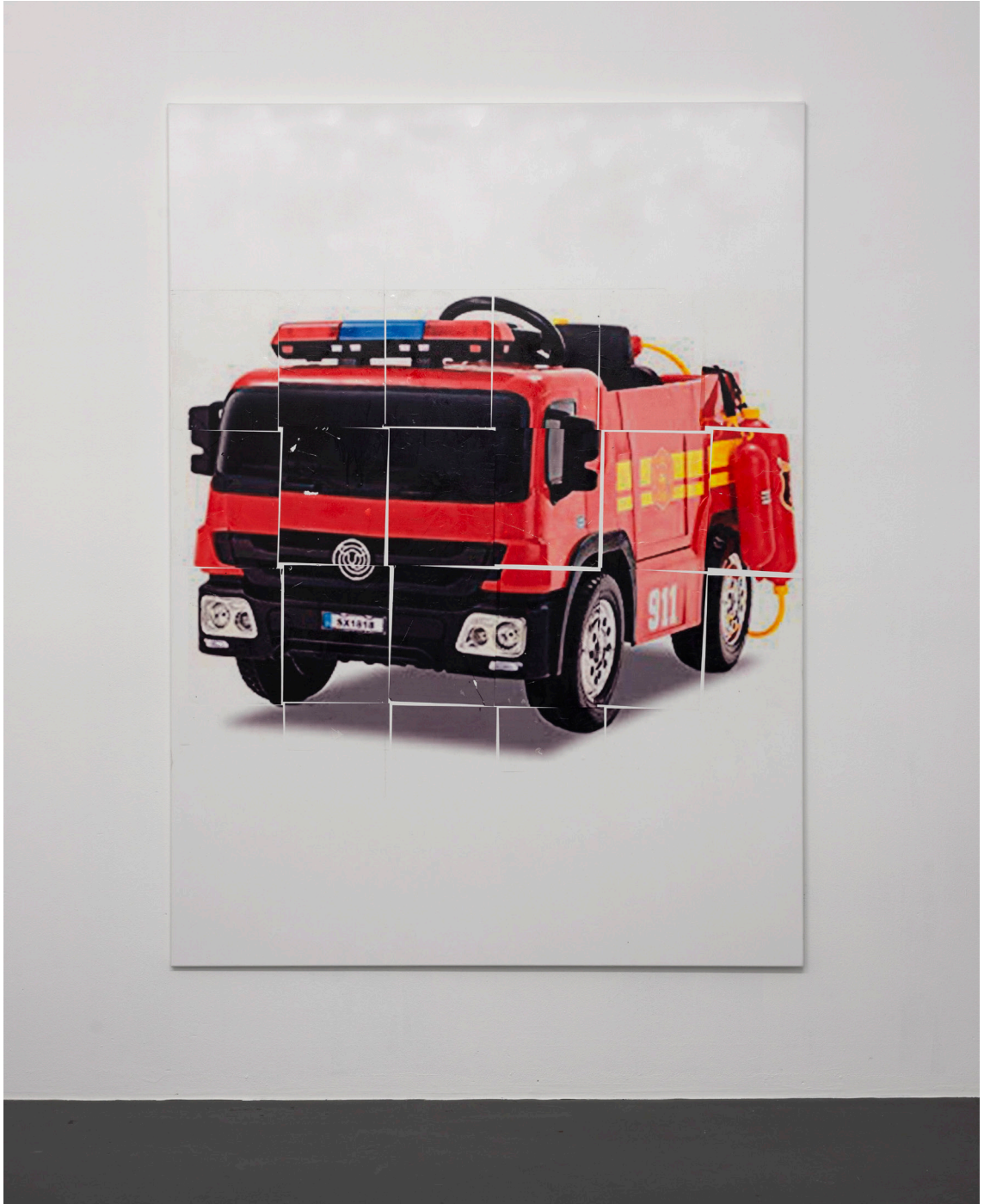
Gili Tal Emergency 2019 Lazertran, oil and enamel on canvas 165 × 135 cm TAL_003145