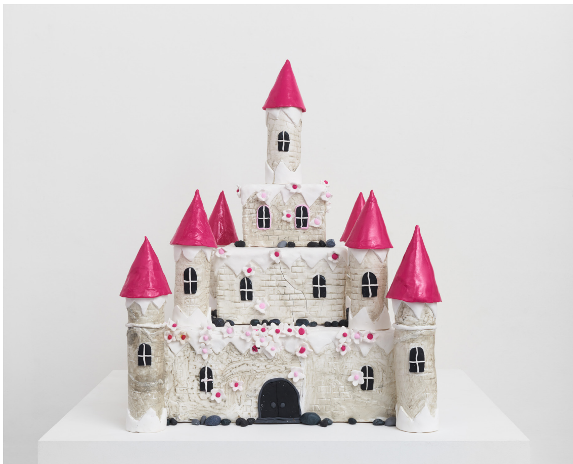
Gina Fischli Capital House 2019 Fimo clay, plywood 60 × 60 × 72 cm FISC_003138