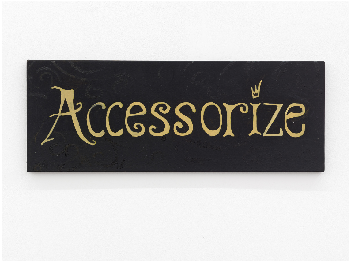
Morag Keil Accessorize 2018 Acrylic on canvas 30 × 70 cm KEIL_003141