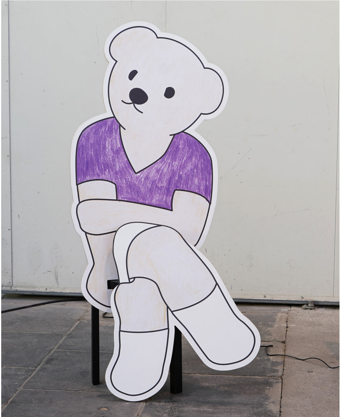
Timothy Davies Single Bear Seated (Artek) 2019 Paint and UV direct print on plywod, stool 146 × 85 × 34 cm DAVI_003136