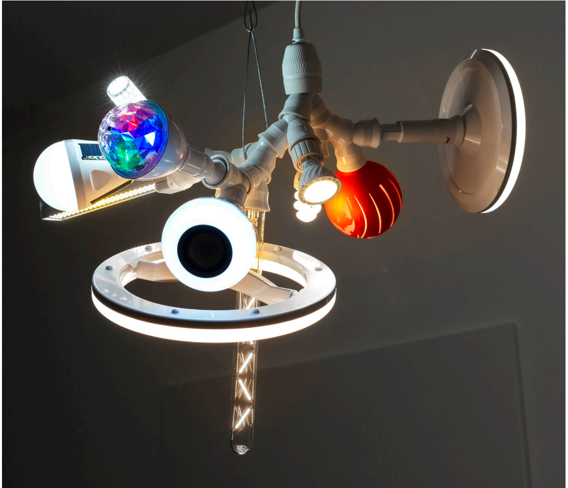
Kaspar Müller Untitled 2019 Doublesockets, bulbs, glue, wire 60 × 45 × 48 cm MÜLL_003144