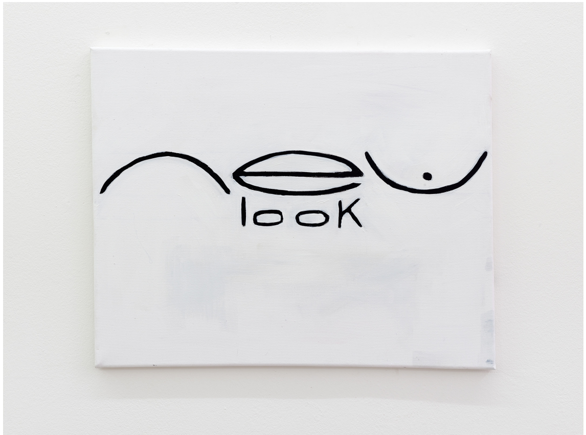
Morag Keil New Look 2018 Acrylic on canvas 41 x 55 cm CORI_003142