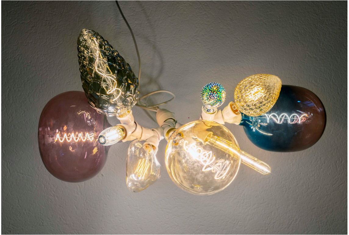
Kaspar Müller Untitled 2019 Doublesockets, bulbs, glue, wire 74 × 32 × 44 cm MÜLL_003143