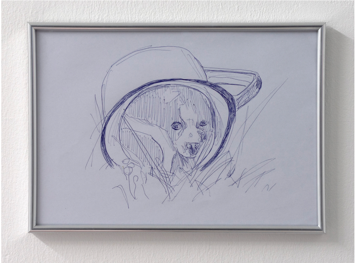
Gili Tal Hiding 2019 Pen on paper 21 × 29 cm TAL_003146