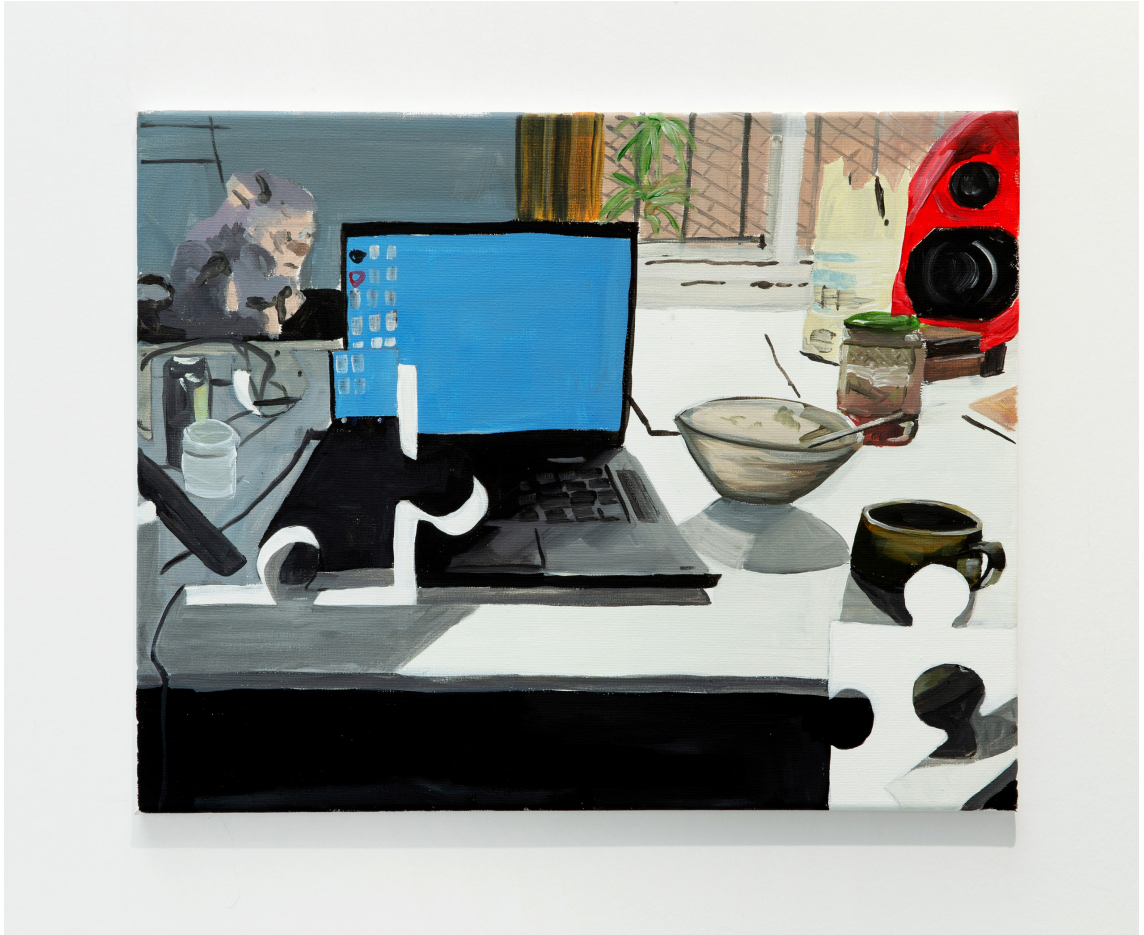
Morag Keil Jigsaw 2019 Acrylic on canvas 41 × 51 cm KEIL_003140