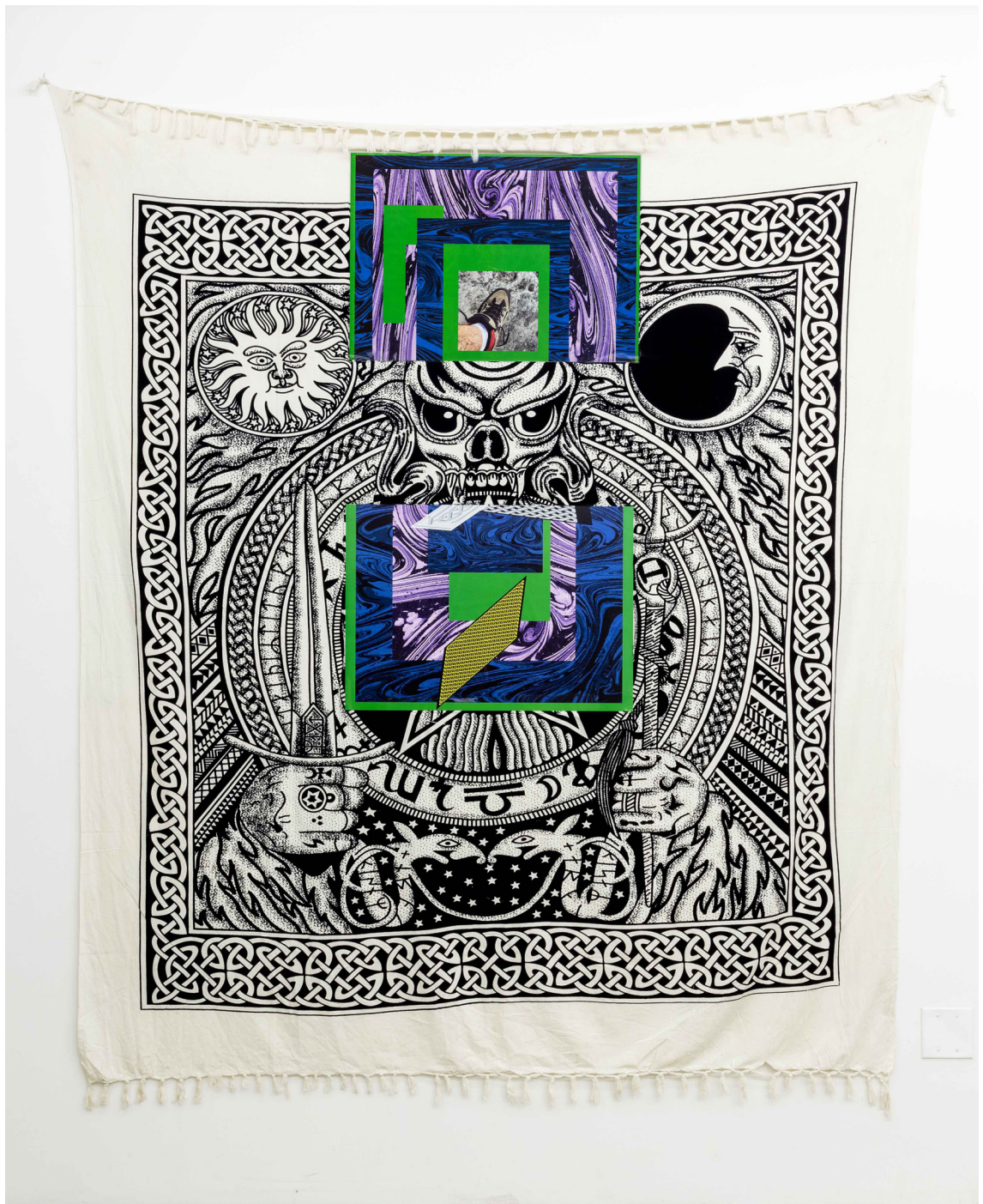
Hennin Bohl I don't want to parent your flaws but your freedom needs some patronizing 2015 Offset print, fabric, clipframe 244 × 178 cm BOHL_003127