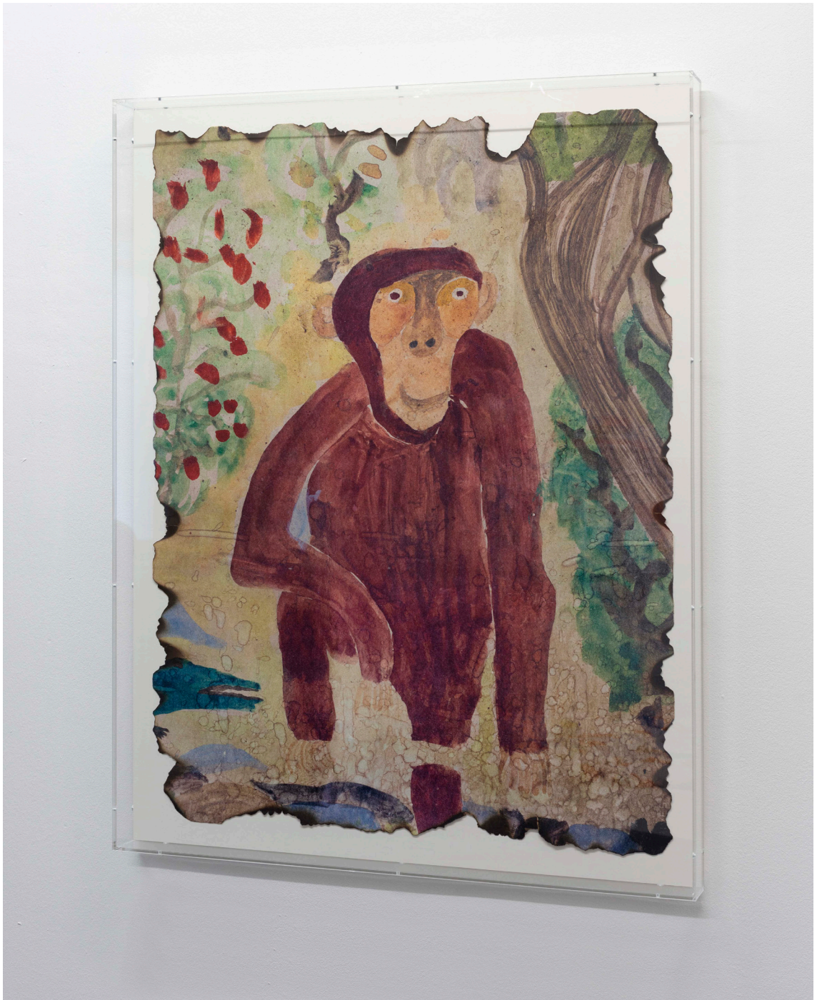
Peter Fischli Untitled 2019 Lithography on hand-made paper, ash, plexiglass artist frame Unique 106 × 80 × 5 cm FISC_003139