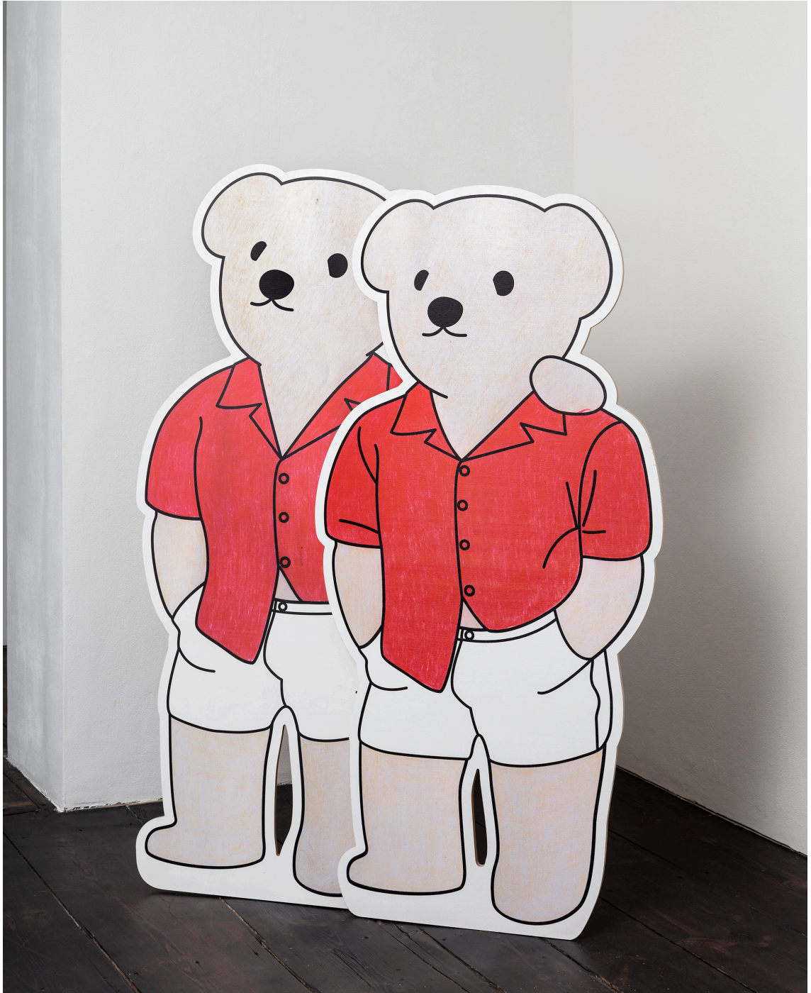
Timothy Davies We 2 Bears (Double Beach Bum) 2019 Paint and UV direct print on plywood 154 × 114 × 48 cm DAVI_003135