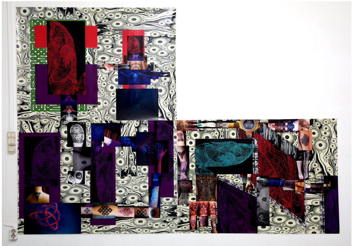
Hennin Bohl Knot Guy 2017 Three posters, offset print Ed. 2/3 + 1 AP 200 × 288 cm BOHL_003133