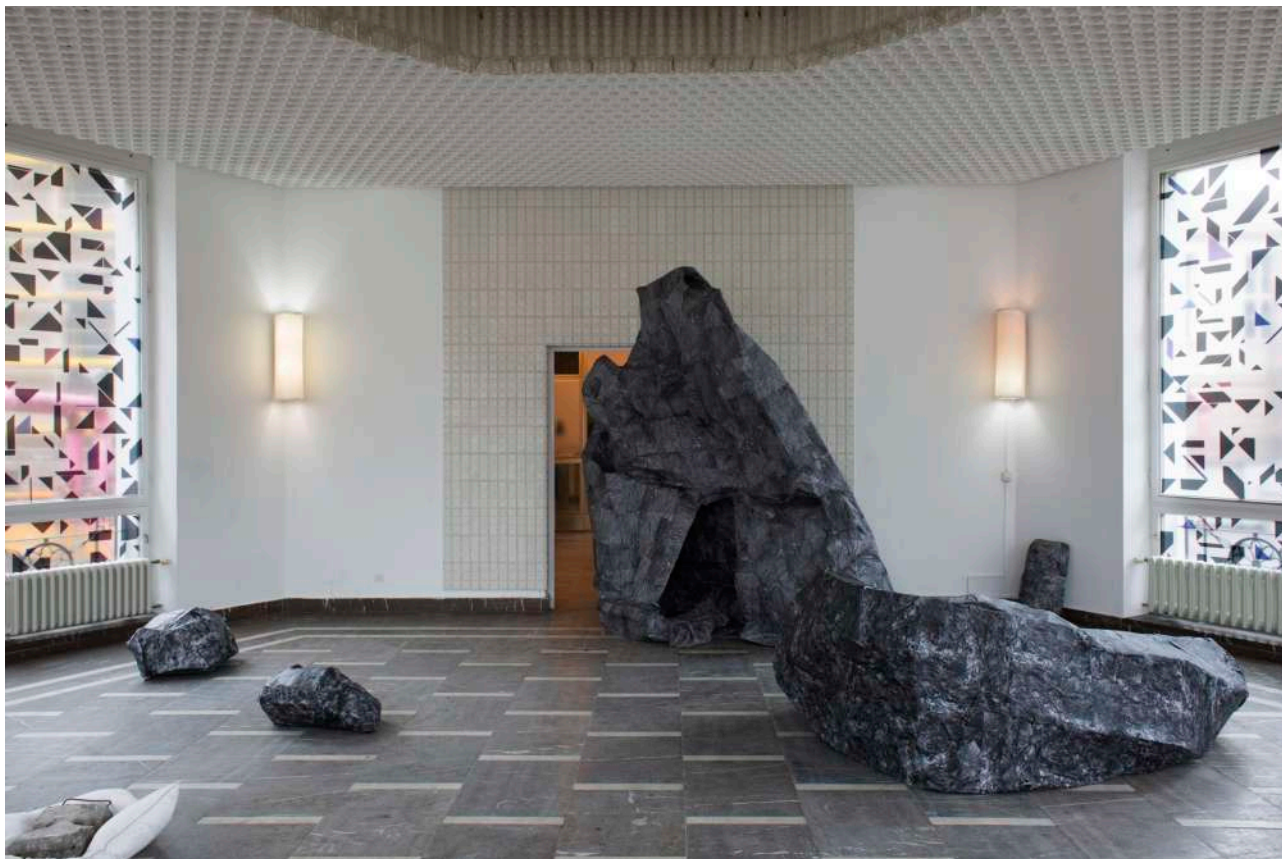
Schinkel Pavillon, exhibition view | vue de l'exposition

>> Please contact us for HD photos | n'hésitez-pas à nous contacter pour obtenir des photos HD