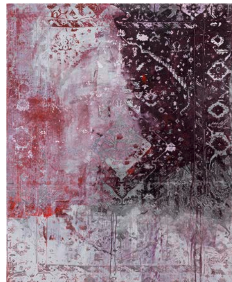
07 Rudolf Stingel Untitled, 2012 Oil and enamel on canvas, 300 x 242 cm © Rudolf Stingel