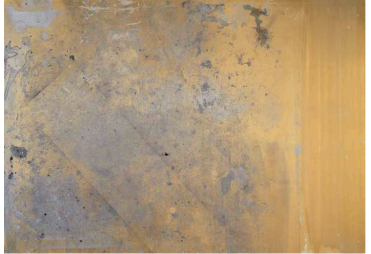
11 Rudolf Stingel Untitled, 2010 Oil and enamel on canvas, 330.2 x 470 cm Pinault Collection © Rudolf Stingel