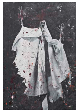
04 Rudolf Stingel Untitled, 2015 Oil on canvas, 241.3 x 165.7 cm © Rudolf Stingel