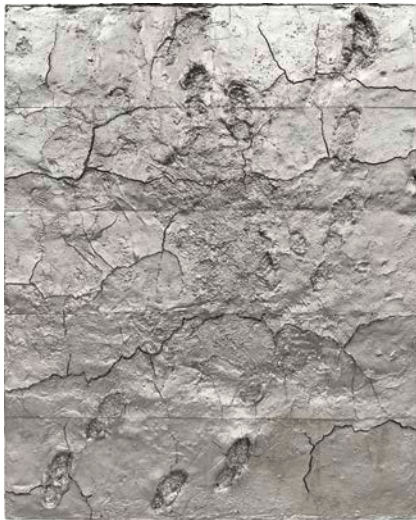
12 Rudolf Stingel Untitled, 2009 Cast bronze and plated nickel, 304.8 x 243.8 cm © Rudolf Stingel Photo: Alessandro Zambianchi