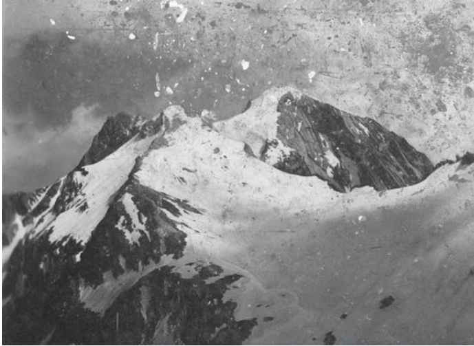
10 Rudolf Stingel Untitled, 2010 Oil on canvas, 335.3 x 459 cm The Broad Art Foundation © Rudolf Stingel