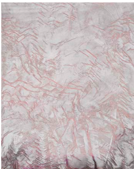
06 Rudolf Stingel Untitled, 2019 Oil and enamel on canvas, 241.3 x 193 cm © Rudolf Stingel