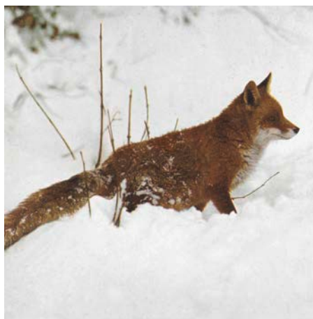
03 Rudolf Stingel Untitled, 2013 Oil on canvas, 127 x 127 cm © Rudolf Stingel