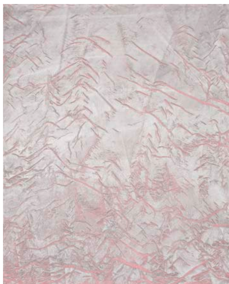
05 Rudolf Stingel Untitled, 2019 Oil and enamel on canvas, 241.3 x 193 cm © Rudolf Stingel