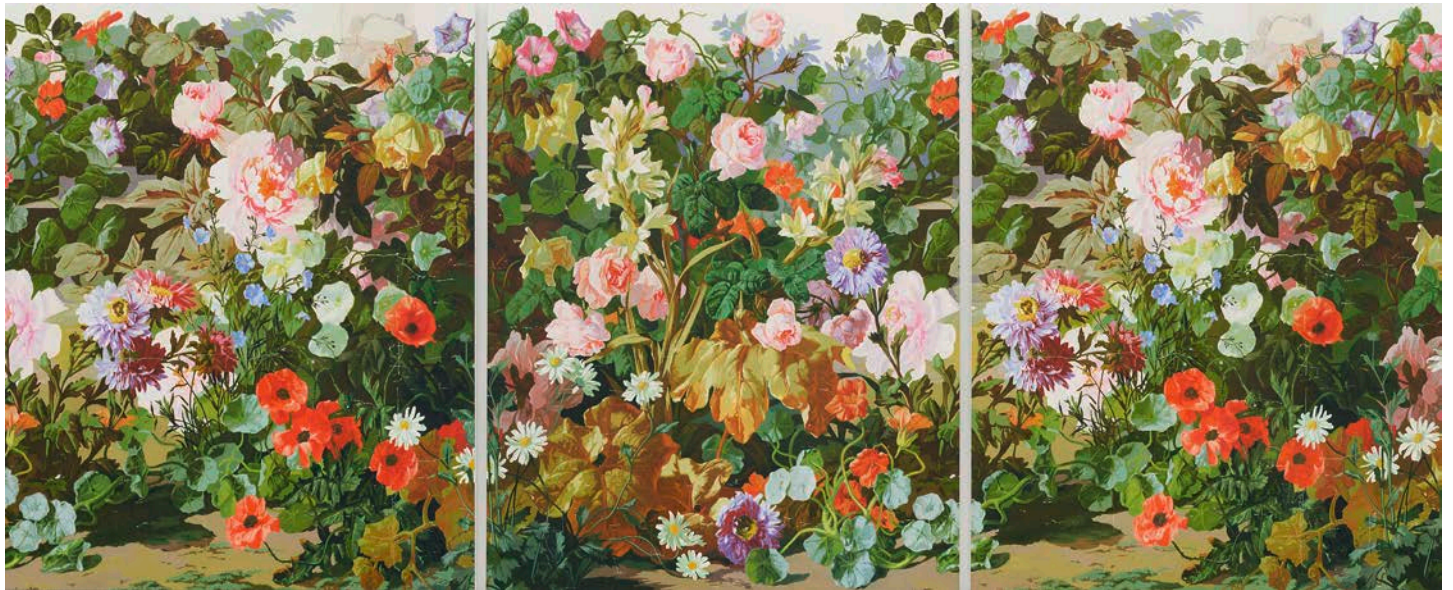
08 Rudolf Stingel Untitled, 2018 Oil on canvas, 241.3 x 589.3 cm; 241.3 x 589.3 cm ; 3 parts, each: 241.3 x 193 cm © Rudolf Stingel