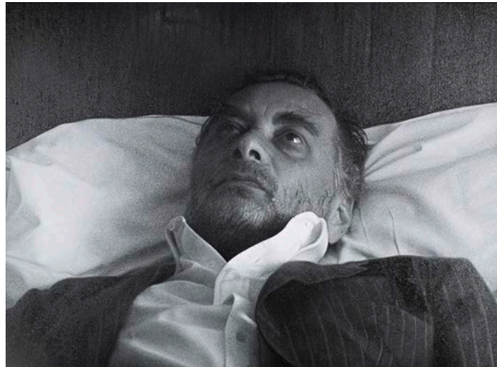
13 Rudolf Stingel Untitled (After Sam), 2006 Oil on canvas, 335.3 x 457.2 cm © Rudolf Stingel