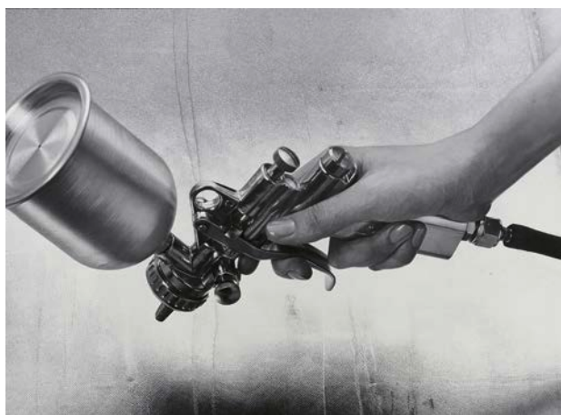
02 Rudolf Stingel Untitled, 2019 Oil on canvas, 335.3 x 457.2 cm © Rudolf Stingel